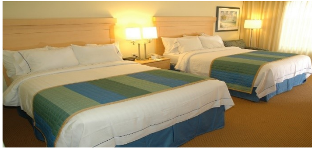
(not actual room)

Rooms for the 2023 Pa. State Convention to be held June 22-24, 2023 at the Red Lion Hotel, 4751 Lindle Road, Harrisburg, Pa. 17111 are now available for booking. Please contact the hotel directly at (717) 939-7841, the room rate is $132.09 (including tax). If you choose prompt 1 for reservations, it will send you to the call center. Choose 0, then you can speak to someone at the hotel.