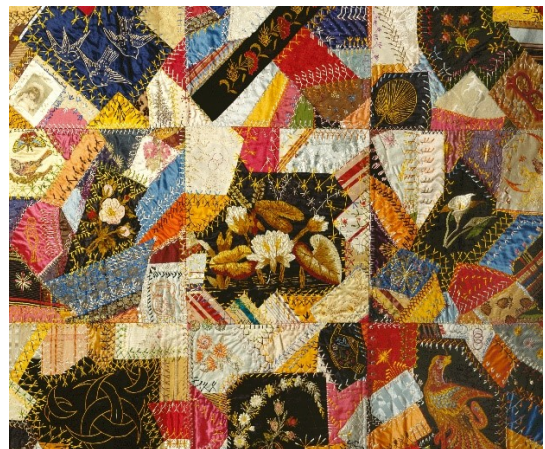
(not actual quilt)